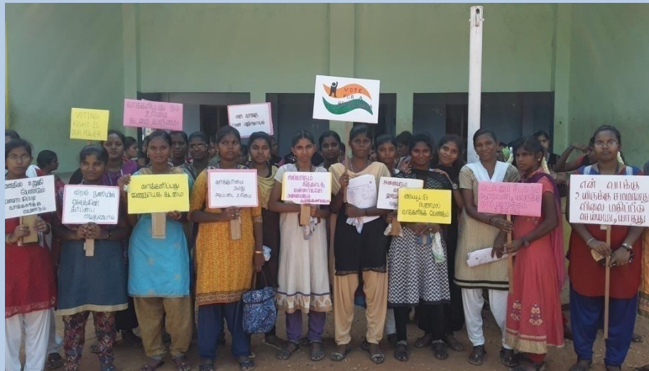
Voting Rights Awareness Placard Campaign