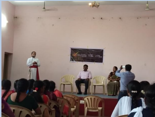
About QR CODE