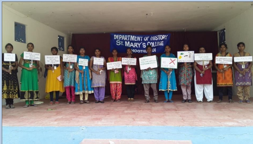
Plastic Awareness Programme at Tharuvaikulam