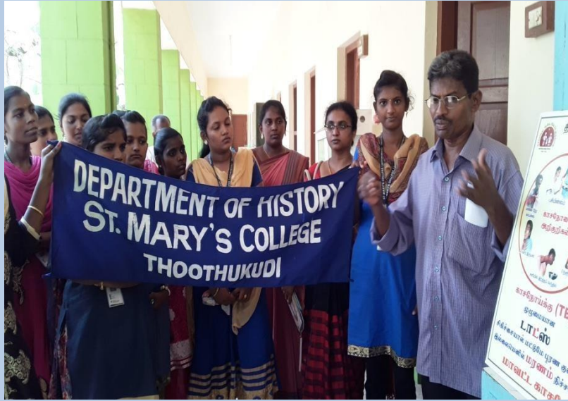
St. Joseph Leprosy Hospital, Arokiapuram, Thoothukudi