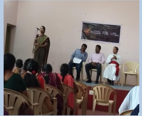
Talk on Postal Banking