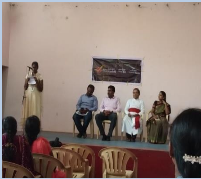
Awareness Song On Saving