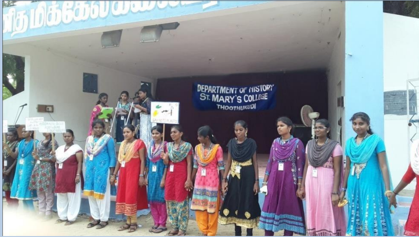
Human Chain – ‘Say No to Plastics’